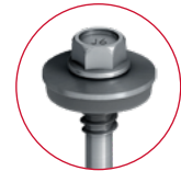
Self-drilling screw JT6-D-12H-5.5/6.3

A4 stainless steel available upon request