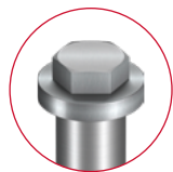
SUPERPLUS SLS A4