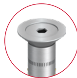
SUPERPLUS SKLS A4