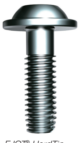
EJOT® HardTip ALtracs® Plus