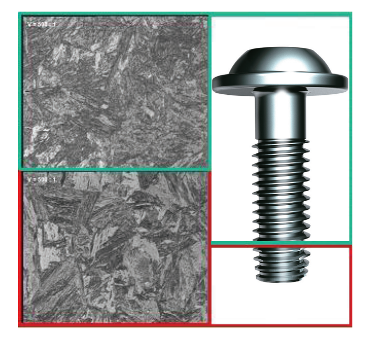
Microstructures of EJOT® HardTip screws