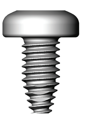
EJOT® HardTip SHEETtracs®