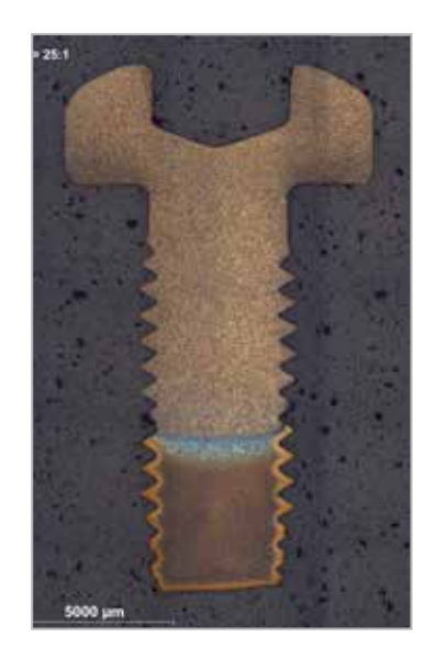
Hardness zones of a duoHARDtip® Spiralform

Hardened and tempered shaft, hardness category 8.8 or 10.9